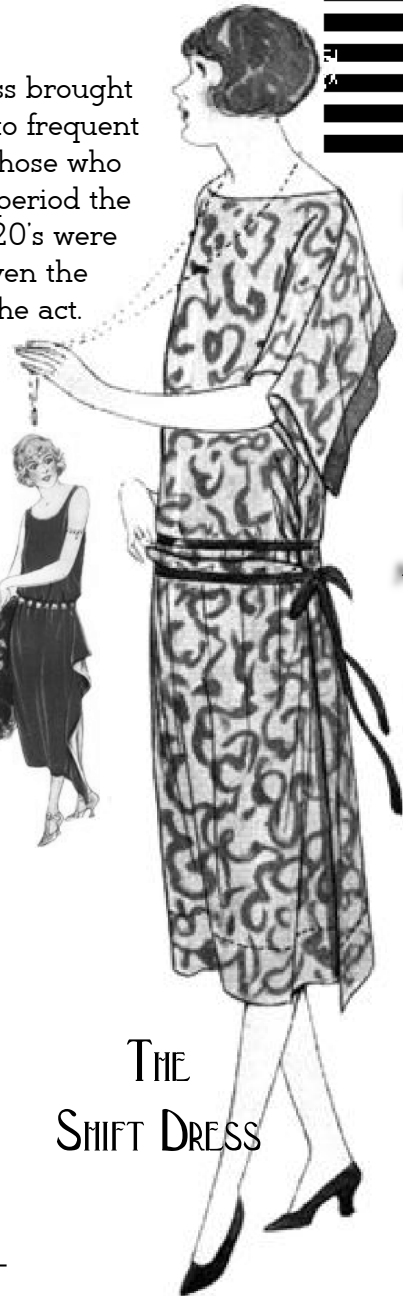
THE SHIFT DRESS

INSIDE: A STEP BY STEP GUIDE FROM MAKEUP AND SHOES TO HOW TO DRESS THE KIDS